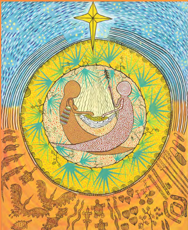
Artwork: Bright Star by Grace Kumbi

The reading we share today is from the Gospel of Luke (2:8-20)