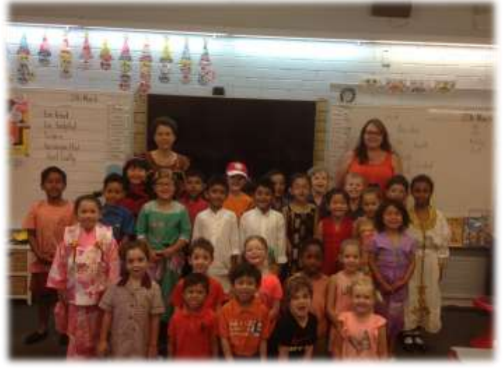
Our 1M Class celebrating Harmony Day